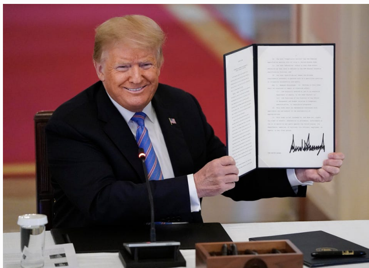
President Donald Trump

President Donald Trump paused student loans for one more month.